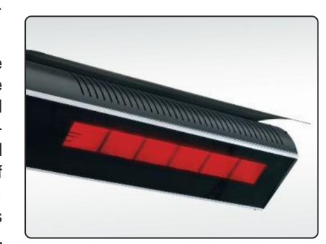
An optional Heat Shield can be installed to reduce the clearances above the heater

all the great features and benefits of SunStar's new GLASS™ radiant patio heater and how it can help to maximize your profits.